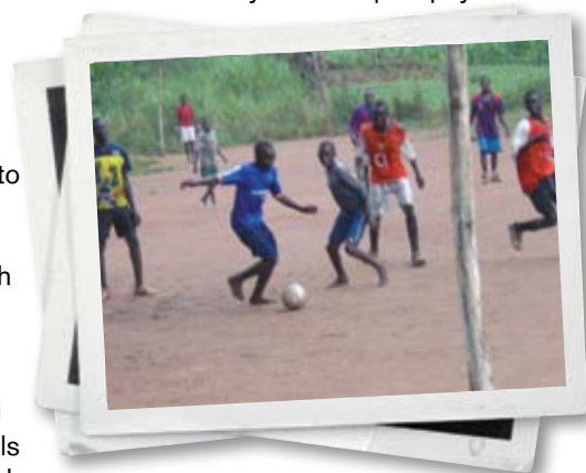
Football Maridi style

The spirit of organised sport builds community ties, self esteem and gives disaffected and troubled young people something to look forward to and a productive outlet for their energy. This is as powerful an outcome as any world cup trophy.