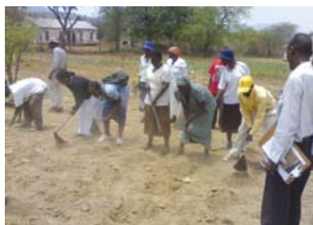
Digging the planting station

"Despite the failing rains and unpredictable dry spells, conservation farmers have consistently managed to register better yields compared to their counterparts practising conventional agriculture," says Addmore. "It provides a viable option for poor farmers."