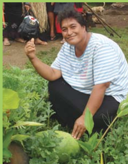
Growing better melons