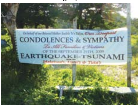
Samoa communities were devastated by the tsunami